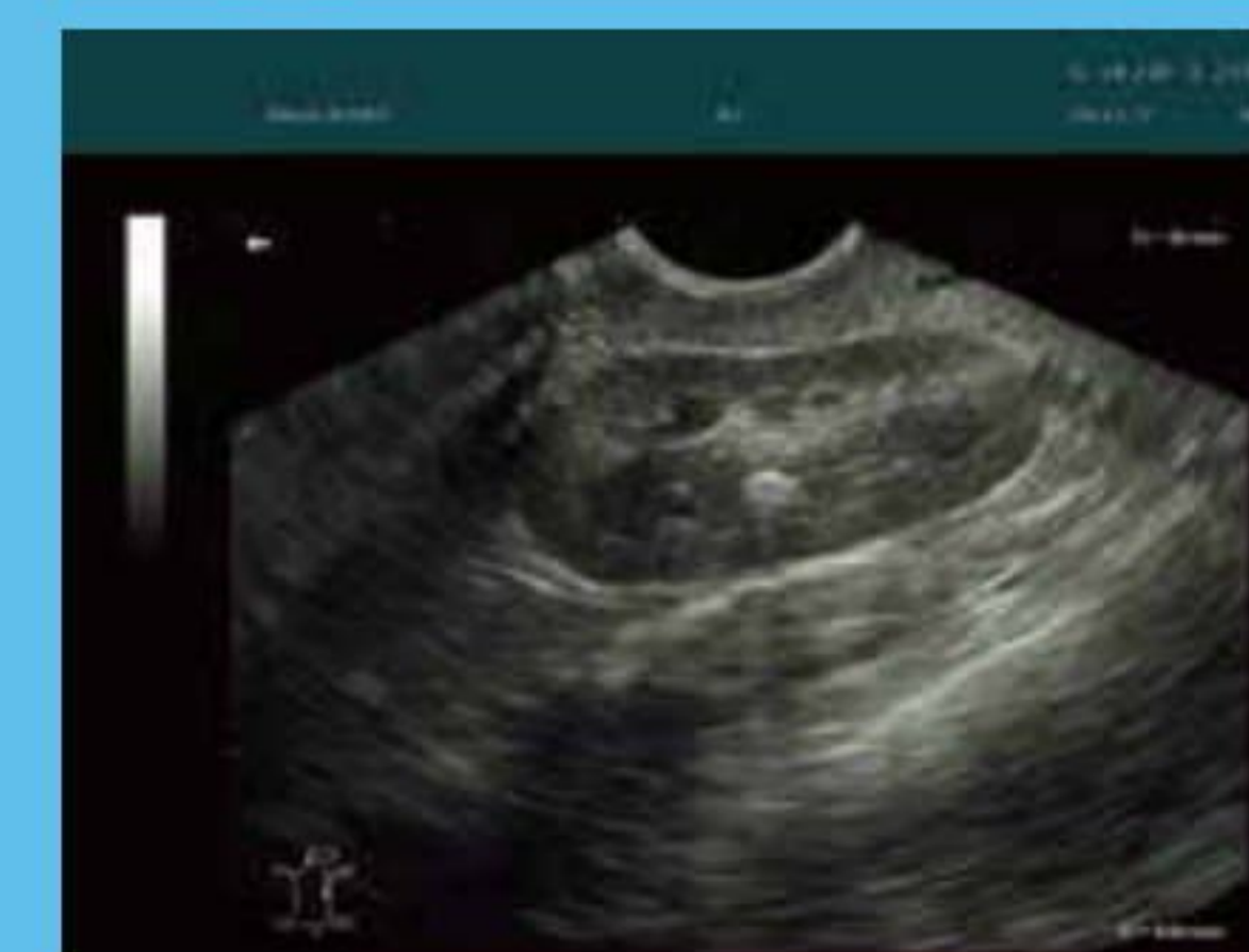
Canine Renal Stone