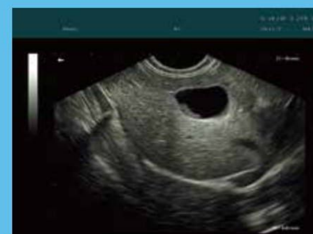
Canine Gall Bladder