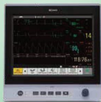
X12 Patient Monitor