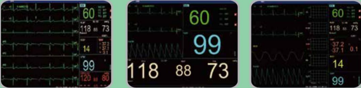
3/5-lead ECG Analysis