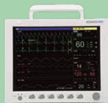
iM8 VET series Veterinary Monitor